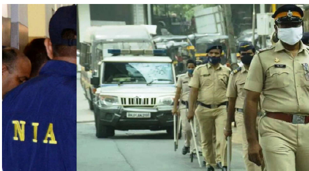
An anonymous email to carry out terror attack in Mumbai. (a representational image).