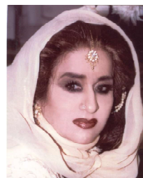
By: Shahnaz Husain

Are you someone who loves to buy perfumes every now and then? Scents elicit emotions and offer a sense of comfort.