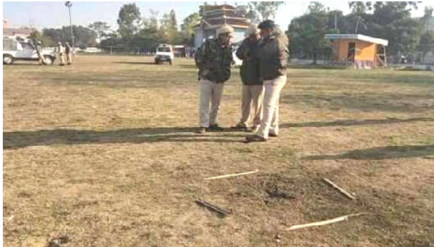
IT News Imphal, Feb 4:

Following a bomb blast that took place at Hapta Kangjeibung in Imphal East where hectic preparation for fashion show featuring Bollywood star Sunny Leone, scheduled tomorrow,